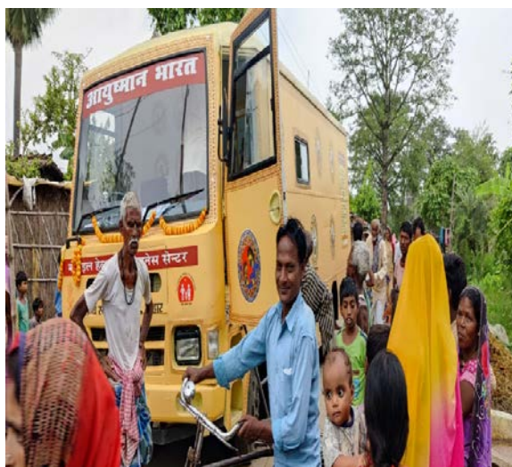
MHWC parked at Anganwadi centre