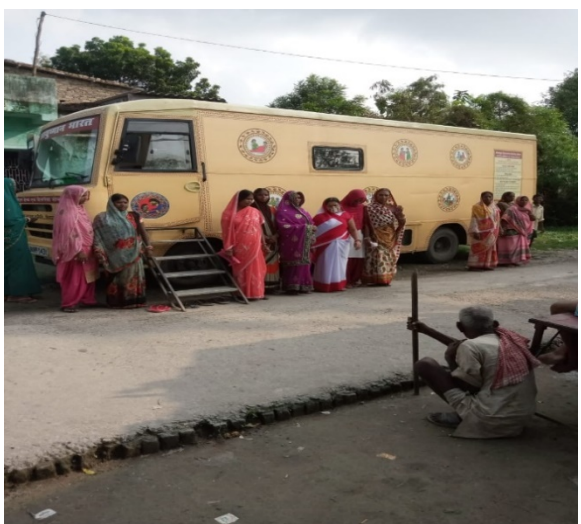
Equity through MHWC ("Health for all")