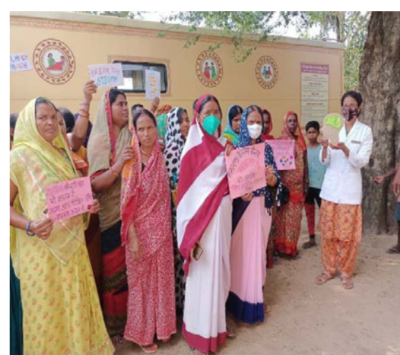
Health Awareness by CHO using MHWC