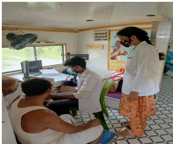
Teleconsultation and screening conducted