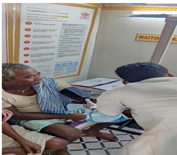
NCD screening conducted by staff Nurse