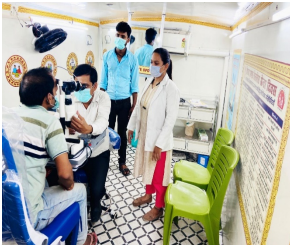
Eye screening at MHWC by Optometrist